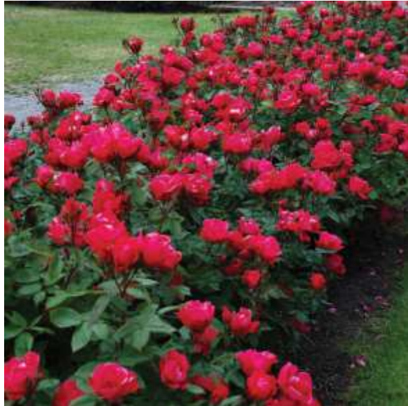
Knock Out Rose Bush