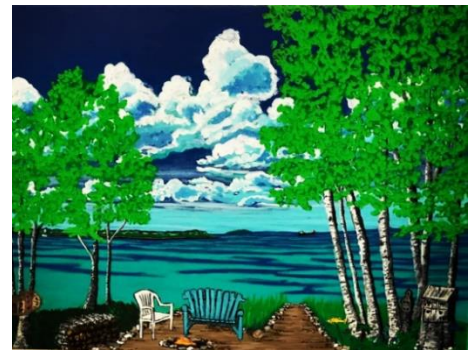
Painting by Jessi Kidder

Artist sign-up information and softball details will be posted on the BBI Facebook groups. What a perfect day of family fun! Bring your sunscreen, your chairs and plan to stay. Great food and snacks will be available from Willie’s Grab ‘n Go food truck. A not-to-be-missed day on BBI . See you there!